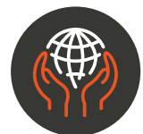
Provide a Positive Impact on the Environment